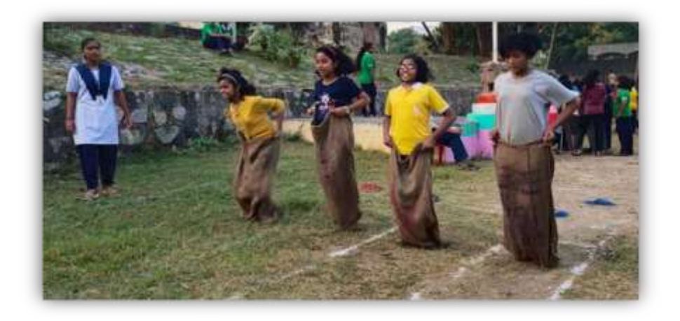
[fun games organised by our group members on children's day]