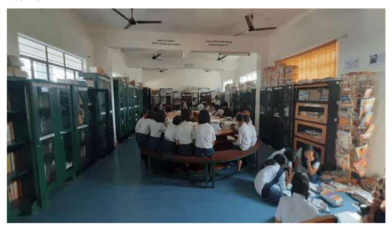
During library observation