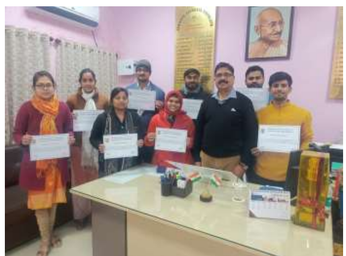
JNV, Pacharhi, Darbhanga

The 04 months internship programme was a very beneficial and fun experience for us,A Hearty thanks Regional Institute Of Education for conducting such programme. I am very proud and privileged of my group members that they all cooperated very well and completed all their task sincerely. There was some up and down in between the journey but 'ALL IS WELL THAT ENDS WELL'